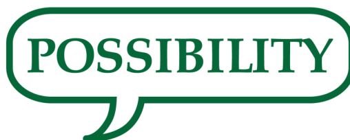
TABLE TALKS: SPEAK POSSIBILITY

We hope you can attend the summer Table Talks! You will be hearing from ministry teams, and will have the chance to respond to the following questions. Worship Team has created a reminder for you to Speak Possibility: come and see!